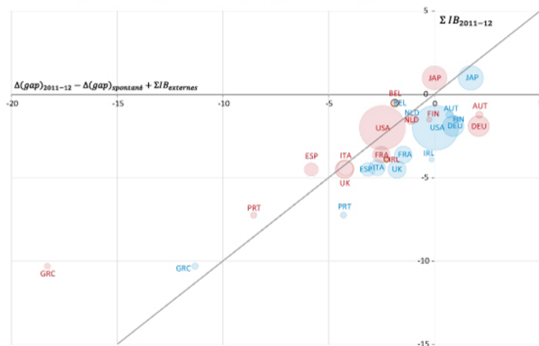
Graphe 2 : Changes in the output gap and the impulse 2011-2012

Source: OECD, Economic Outlook 91, June 2012. The year 2012 is a projection (OFCE forecast October 2012). The area of the bubbles is proportional to real GDP in 2011 ($ PPP).