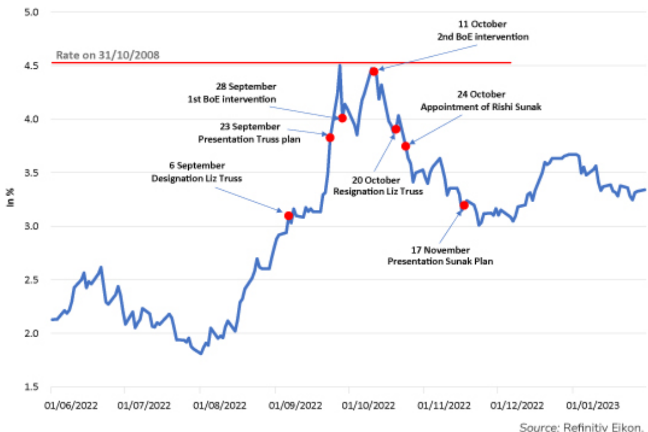
Figure 2. Yield on 10-year United Kingdom government bonds

[1] In the United Kingdom, the financial year starts on 1 April and ends on the following 31 March.