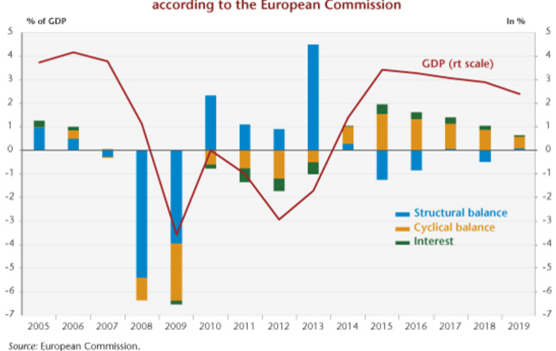
Figure 1. Breakdown of the public balance, as % of GDP, according to the European Commission