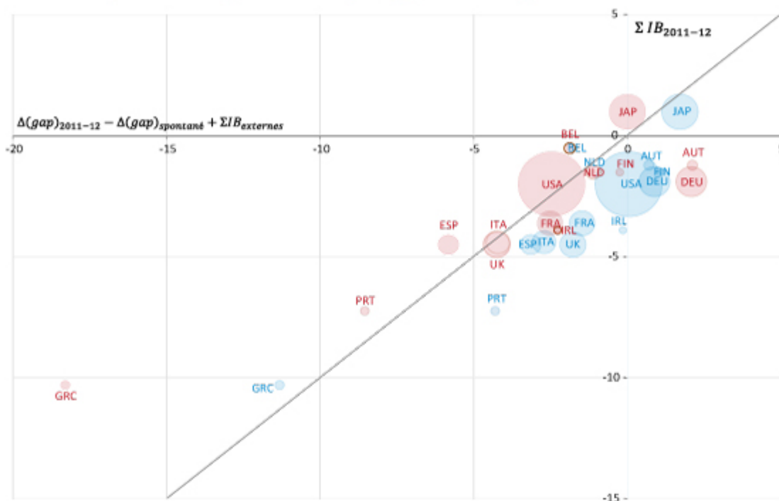
Graphe 2 : Changes in the output gap and the impulse 2011-2012

Source: OECD, Economic Outlook 91, June 2012. The year 2012 is a projection (OFCE forecast October 2012). The area of the bubbles is proportional to real GDP in 2011 ($ PPP).