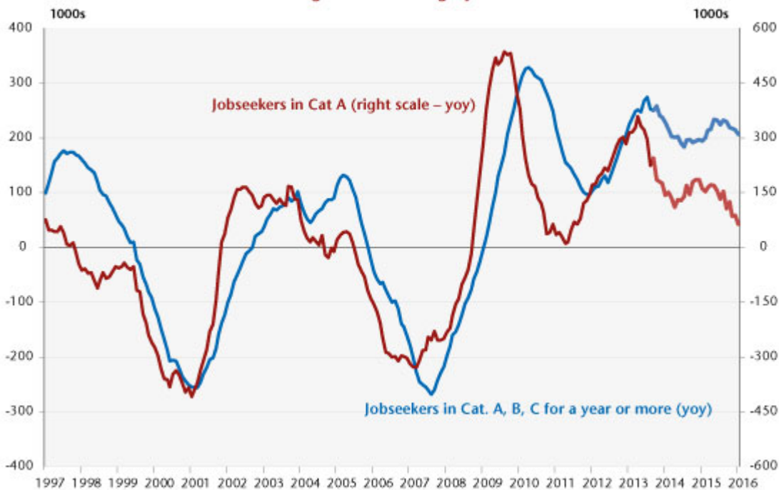
Figure 2. Jobseekers registered in Categories A, B or C for a year or more and jobseekers registered in Category A