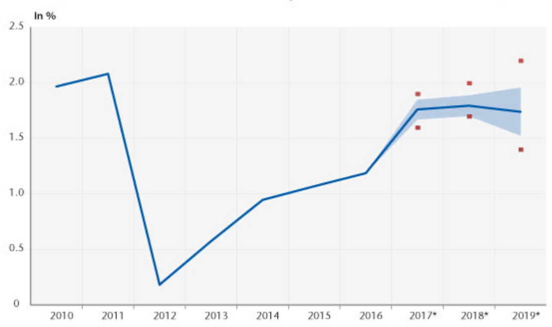
Figure 1. GDP growth in the forecasts (forecasts conducted between September and December 2017)

The years with an asterisk * are the years forecast. The blue line shows the average of the responses supplied by the 18 institutes. The blue band is bounded by the standard deviations. The red points show the maxima and minimums of the forecasts.