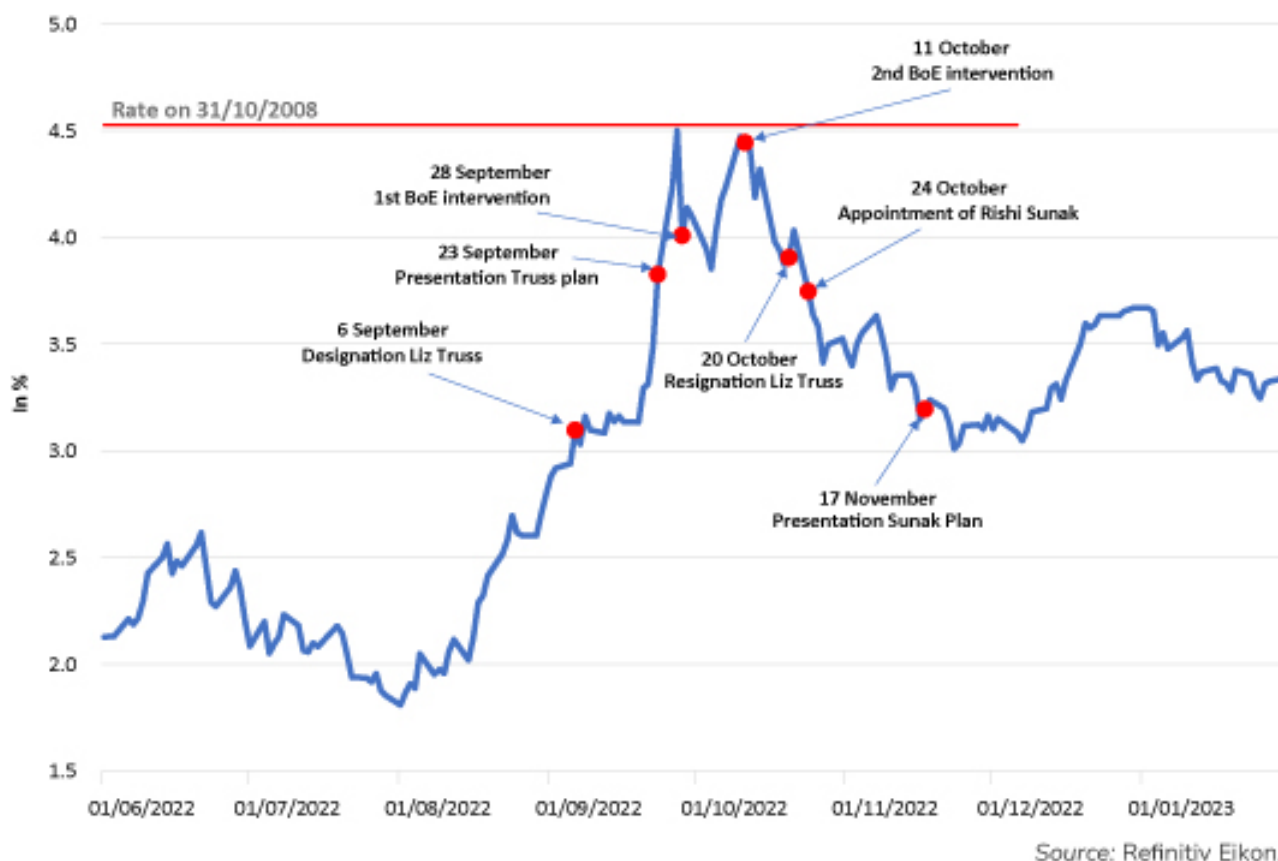
Figure 2. Yield on 10-year United Kingdom government bonds

[1] In the United Kingdom, the financial year starts on 1 April and ends on the following 31 March.